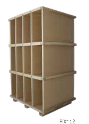
PALLITE PIX Storage

PIX™ is a high-density, flexible storage unit designed to meet the needs of the modern warehouse.